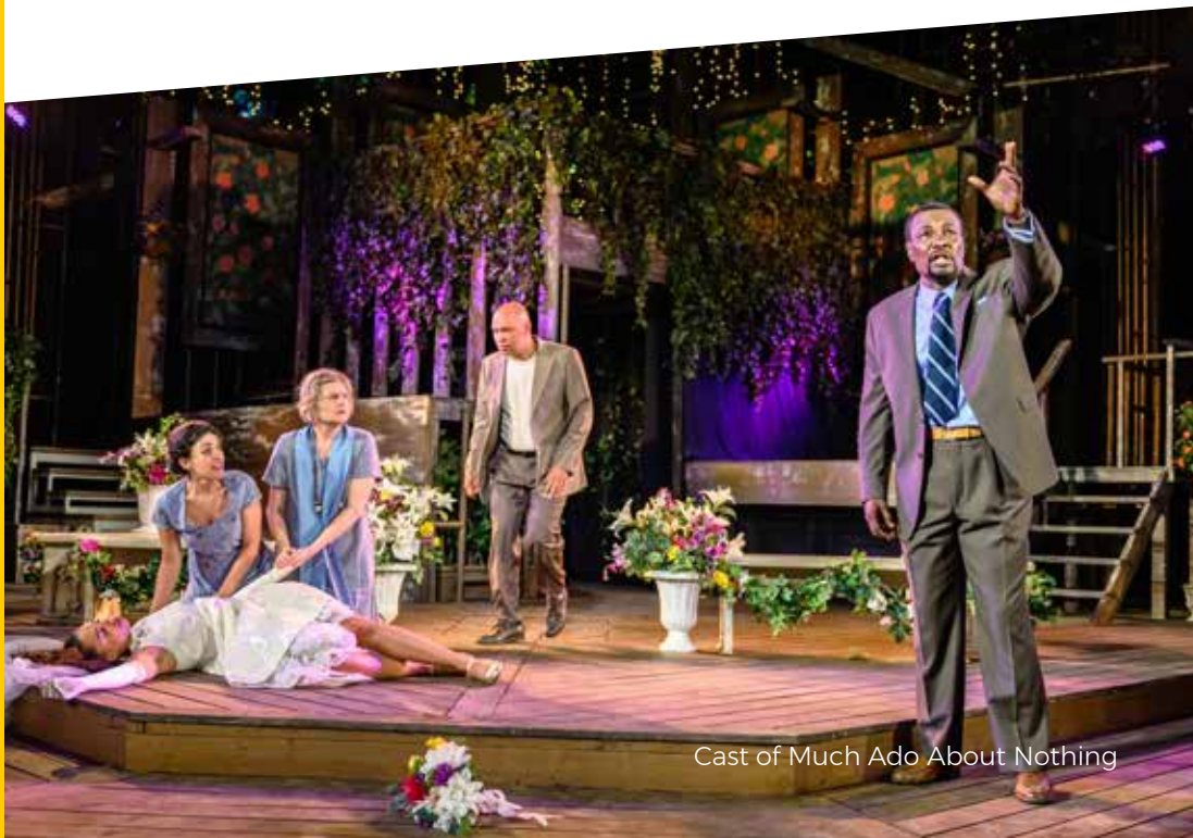
Cast of Much Ado About Nothing